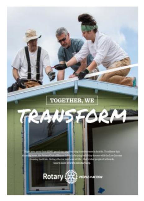
Rotary members work together to build the roof of one of the tiny houses donated by the Rotary Club of Mercer Island.